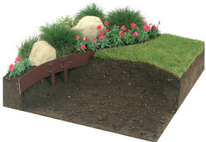
Standard soft landscape application